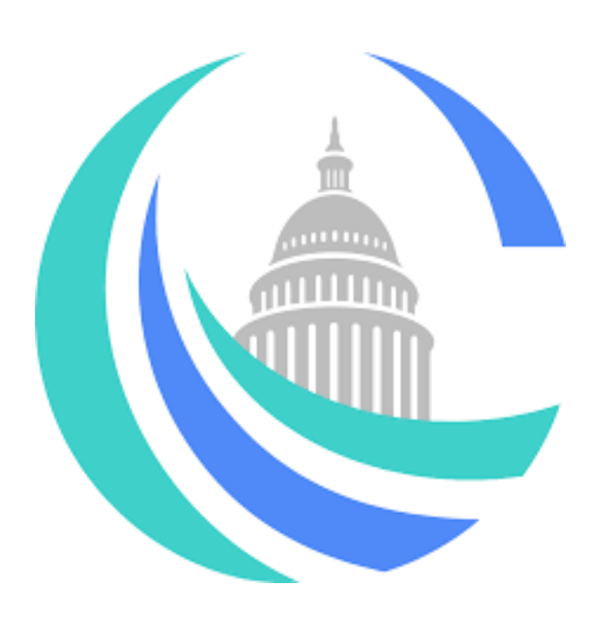
GUMBO 80,000+ Locations